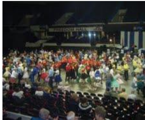
Our HASSDA Gang of Four was obviously enjoying Nationals