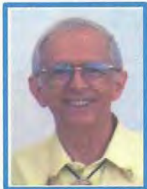
Rounds Cuer Stash Tosio