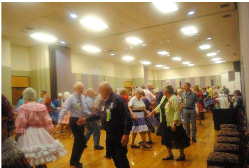
Photo from 2019 HASSDA Festival in Manhattan. Memories of fun to come.