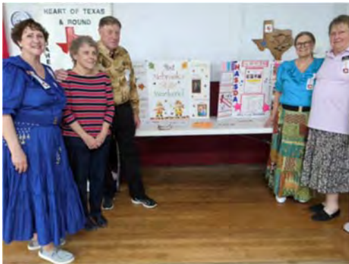
Promoting HASSDA Festival at the TASSD Festival In Waco, TX.

Now that most of the Covid restrictions have been lifted it is time to get out and spread the word about the BEST festival in the Midwest....YES, it is HASSDA! This is your club and we want you to join us in spreading the word. Send us your pictures of you out promoting the Festival.