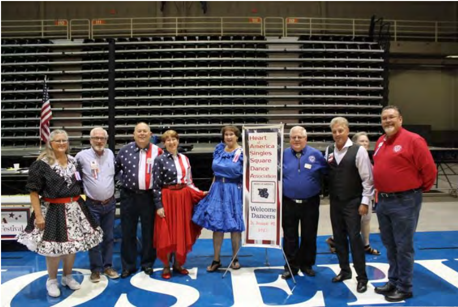
HASSDA Board Members pictured with the calling and cueing staff: