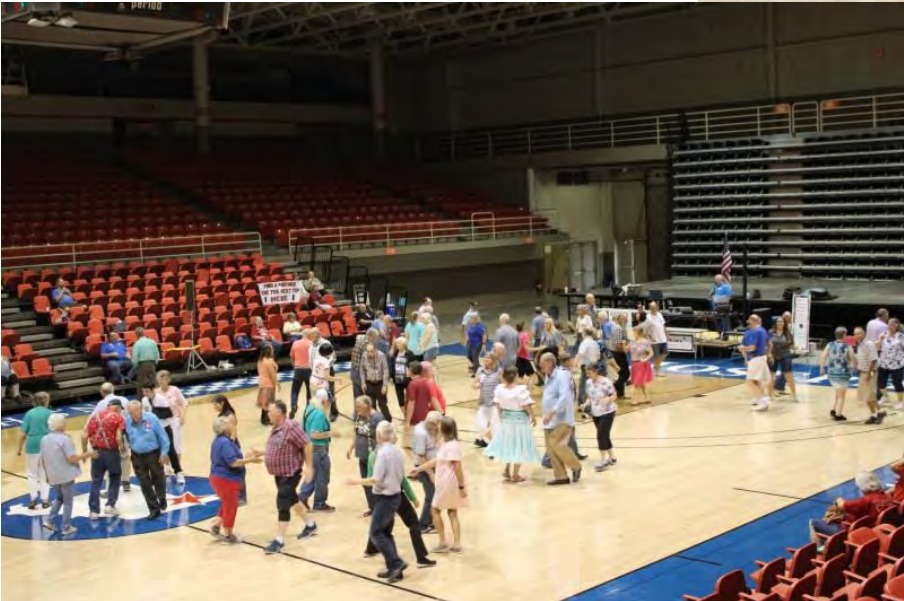
From the Smoothie Hall Saturday afternoon