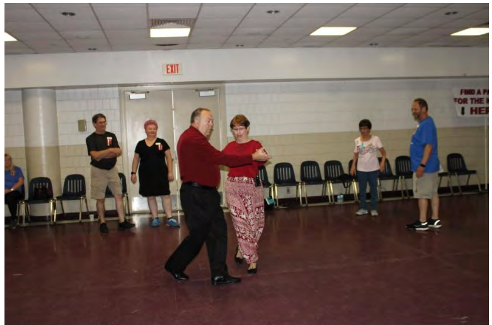
Also popular was Round Dancing

Want to see yourself or your friends in pictures?