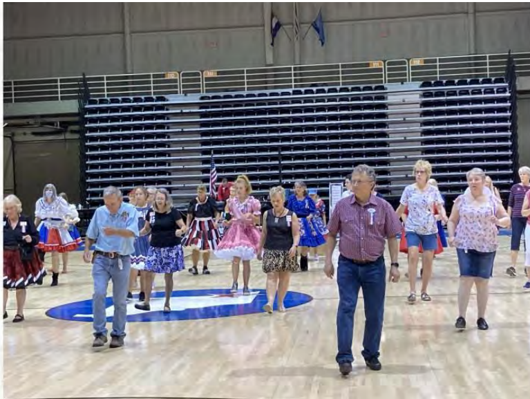
Line Dancing was popular this year